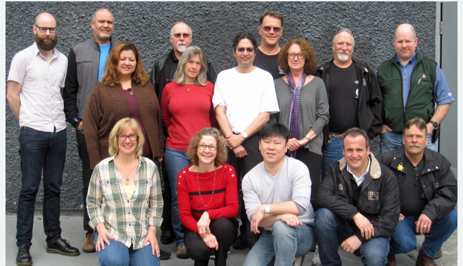
Unionized employee groups made a joint submission expressing concerns with the VSB Attendance Support program at the April 13th budget meeting. Represented were VSTA, VESTA, IUOE, CUPE 15, CUPE 407 and the Building Trades.

Article G.20.2.b. states "When an employee is absent for more than ten (10) consecutive teaching days, he/she shall present