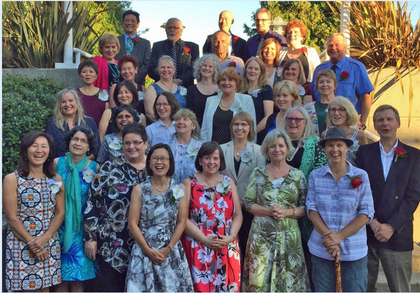
VSTA Retirees' Dinner, Royal Vancouver Yacht Club, 2017-06-20