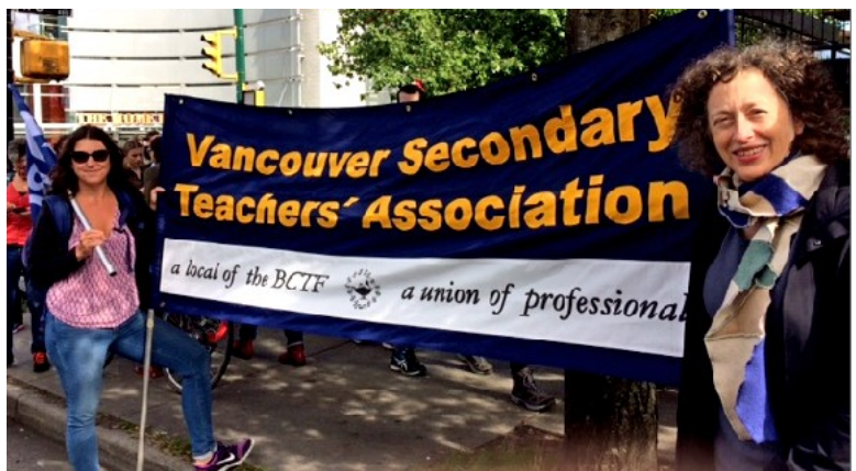
Treena & Katharine, Global Climate Strike, September 27, 2019